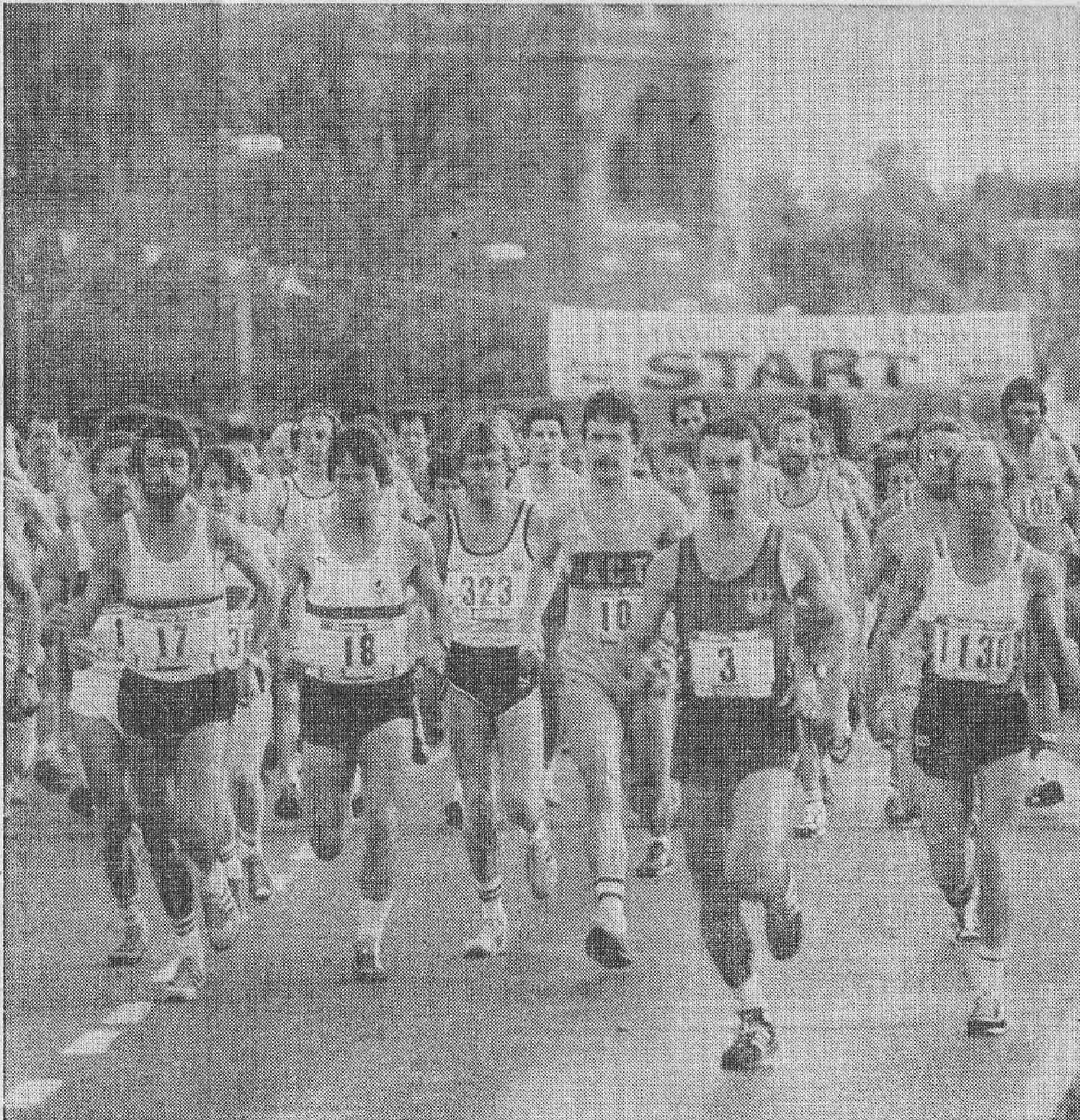
They're off . . . the start of the marathon adjacent to the Adelaide Oval